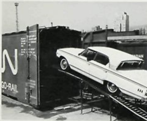
← Passenger's car may travel with him to be available at destination.