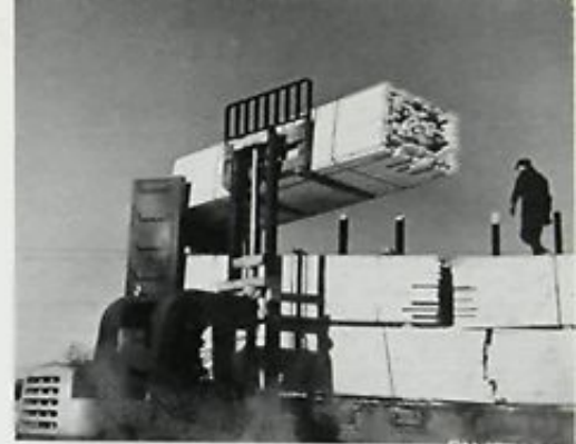
↑ Specially designed lumber-carrying flatcars permit speedy mechanical unloading.