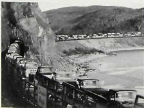
↓ Trainload of tri-level and bi-level automobile and truck carrying rail cars moving westward along Lake Superior.