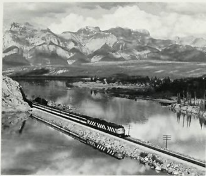
← Modernization has included visual re-design of equipment. A CN Montreal-Vancouver Super Continental, in its new dress, rolls through the Rocky Mountains.