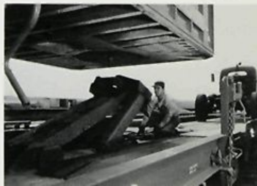
← Tie-down device for securing highway trailers to piggyback flatcars.