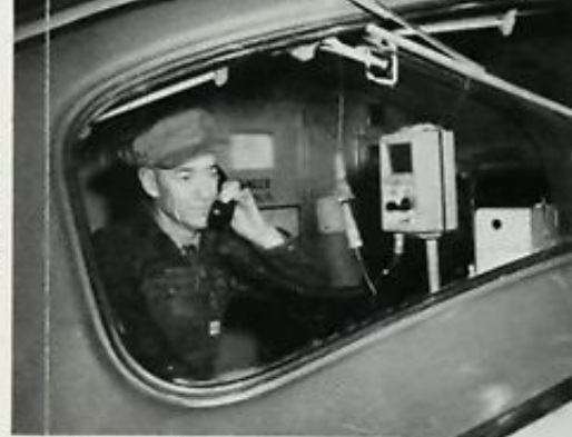
↑ Three mobile radio systems permit communication from train to train, from train to wayside and from head-end to tail-end.